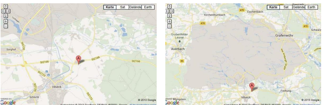
The above maps show the location of Forstamt Grafenwöhr in relation to the town of Grafenwöhr and the 7<sup>th</sup> Army JMTC Training Area.

- Invitations to these hunts are non-transferrable. U.S. Forces hunters who have accepted an invitation are obligated to inform both the U.S. Forces office and the applicable Forstamt if they become unavailable to participate in their scheduled hunt.