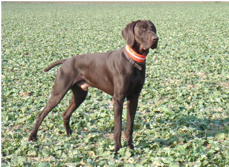
German Shorthaired Pointer (Deutsch Kurzhaar )