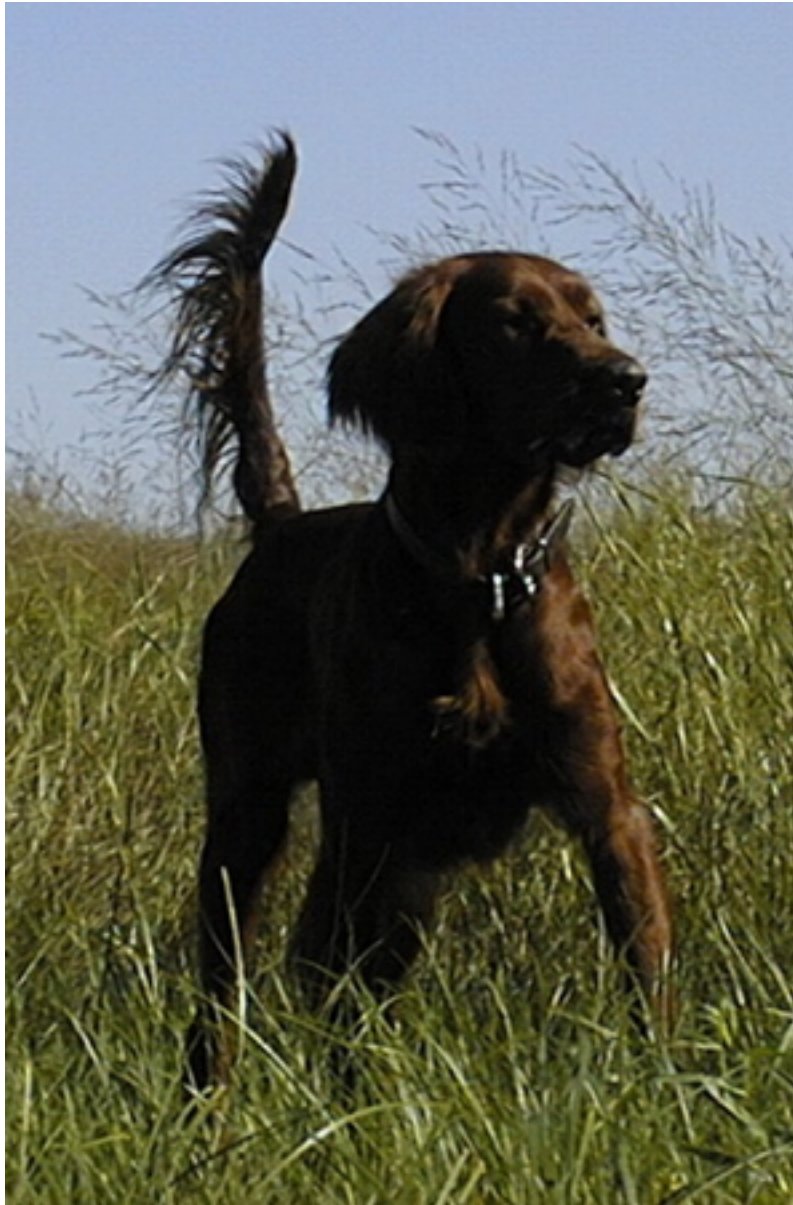
Irish Setter ( Irish Setter )