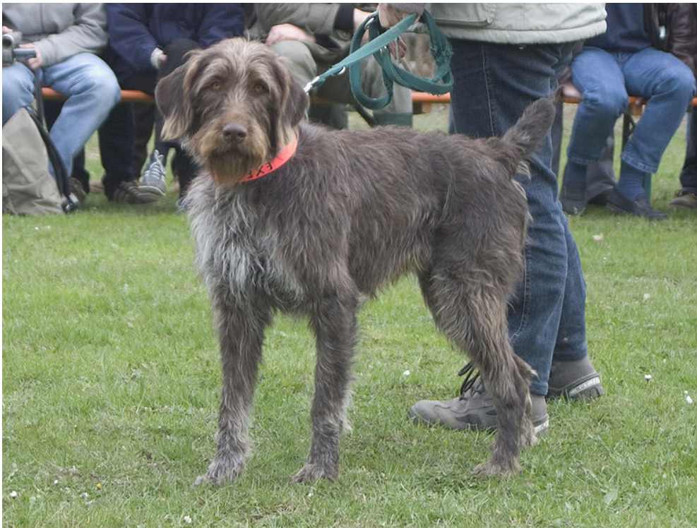
German Rough Hair (Deutsch Stichelhaar )