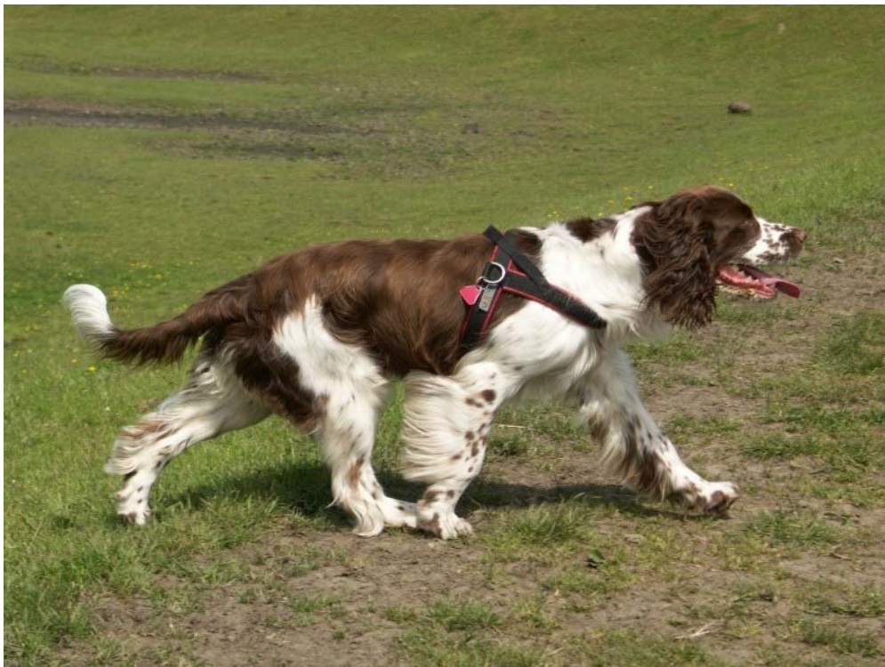
Springer Spaniel ( Springer Spaniel )