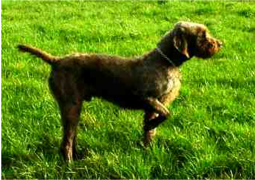
Poodle Pointer ( Pudelpointer )