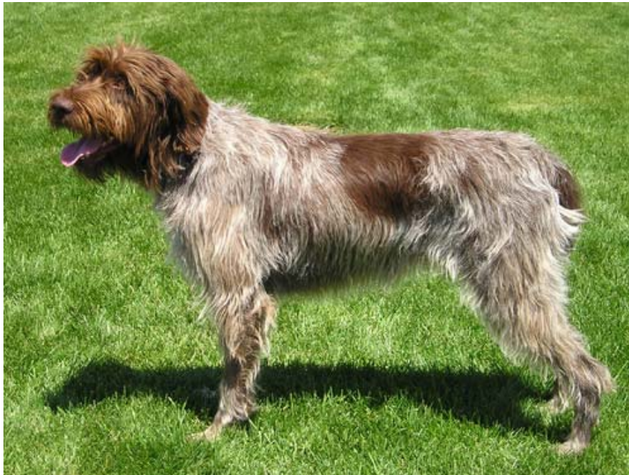
Griffon ( Griffon )