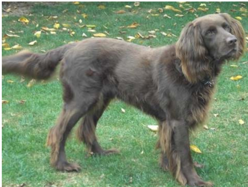
German Longhair ( Deutsch Langhaar )

Pointers ( Vorstehhunde ) are the bird dog types and include the German Short-, Wire- and Long-haired Pointers; Irish Setter; English Setter; and English Pointer. These dogs are used as pointers and retrievers in small game hunting and also for tracking wounded big game. They are clever, easily trained, very willing to trail game, point, and retrieve.