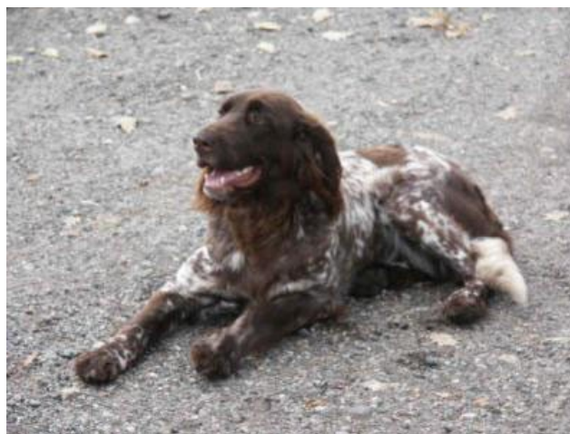
German Longhair ( Deutsch Langhaar )