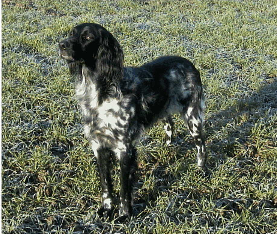
Large Münsterländer ( Grosser Münsterländer )