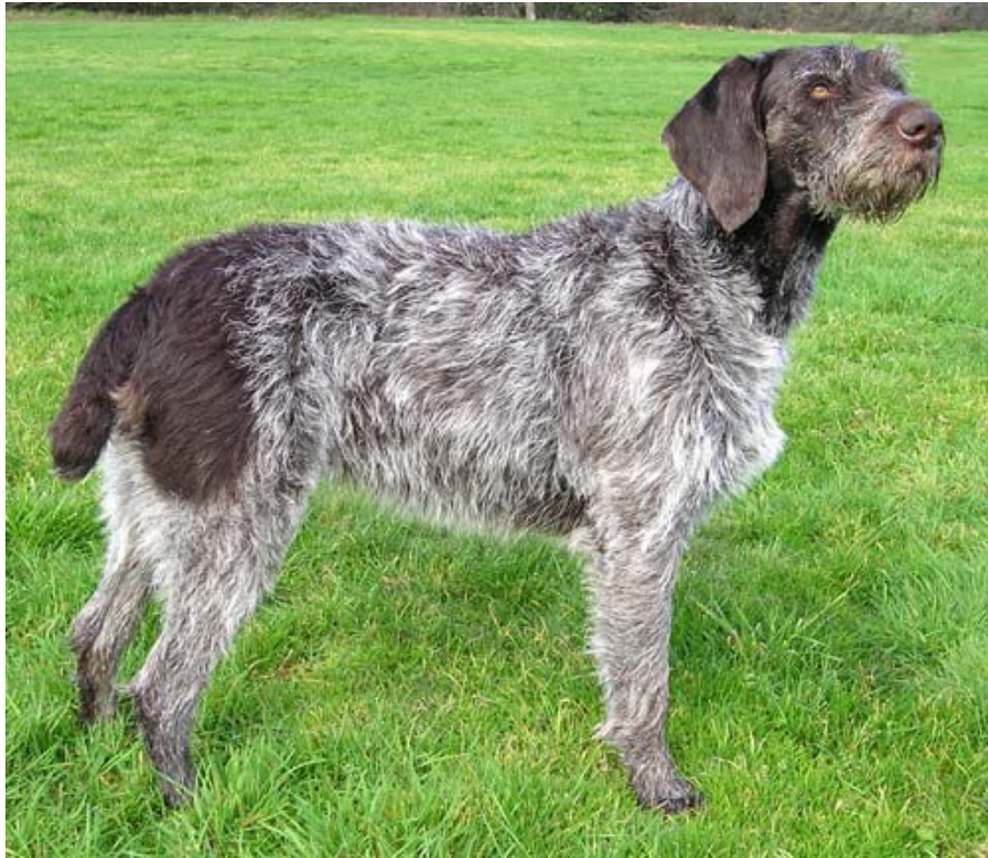
German Wirehair ( Deutsch Drahthaar )