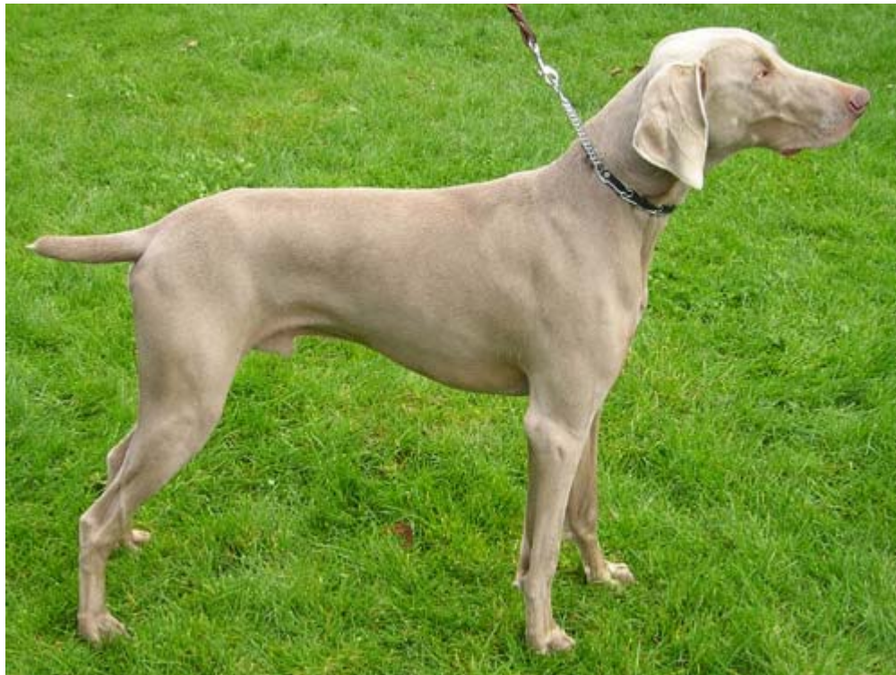
Weimaraner ( Weimaraner )