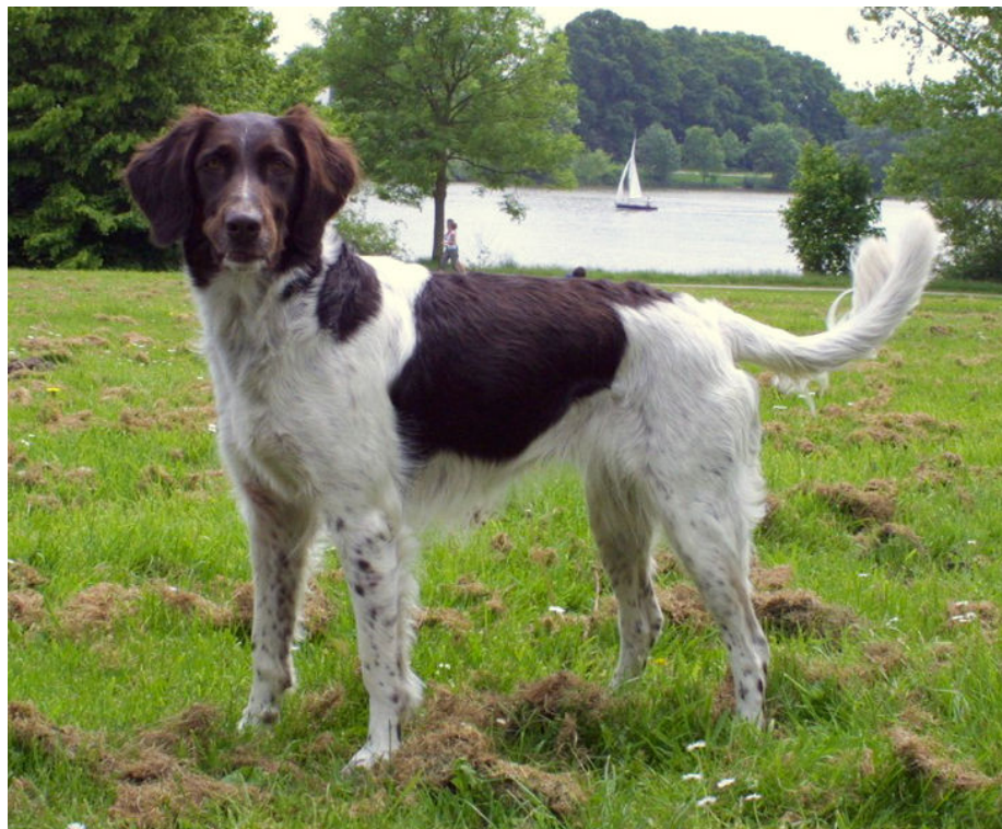
Small Münsterländer ( Kleiner Münsterländer )