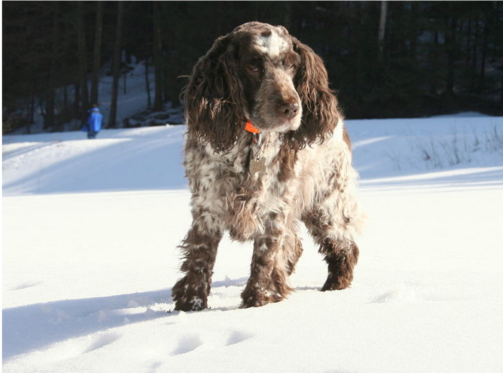
Cocker Spaniel ( Cocker Spaniel )