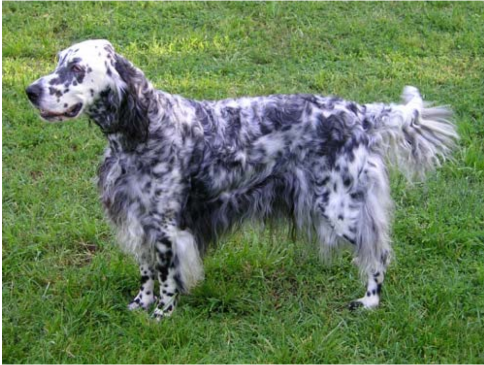
English Setter ( English Setter )