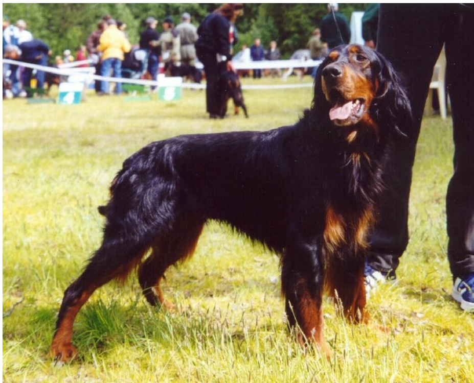
Gordon Setter ( Gordon Setter )