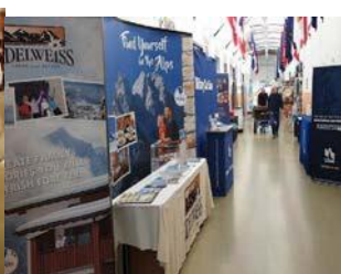
Sponsor Table Display