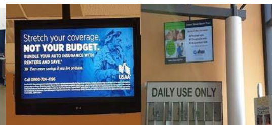
Digital Monitor Ad Displays