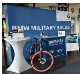
Drawing or Contest

Our goal in every sponsorship relationship is win-win! An investment with Family and MWR has value on multiple levels. Sponsorship may be in the form of cash, products or services, or a combination of all three. Sponsorship is not charitable donations.